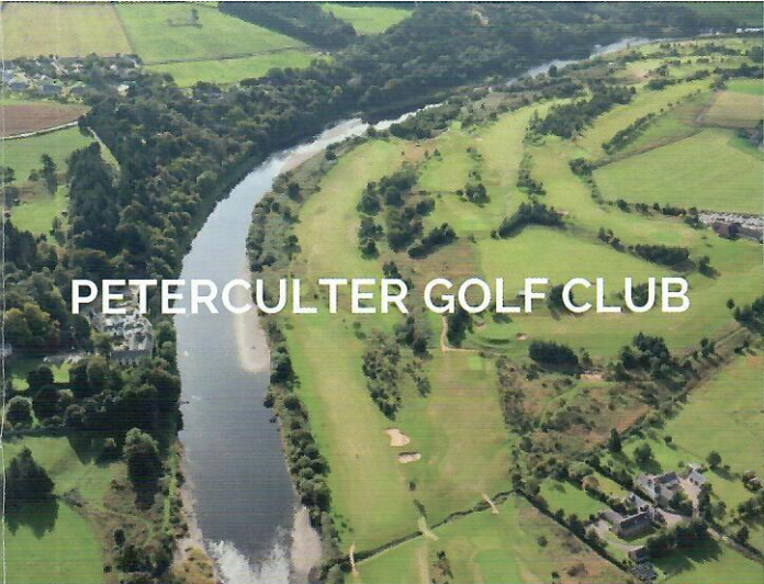
PETERCULTER GOLF CLUB