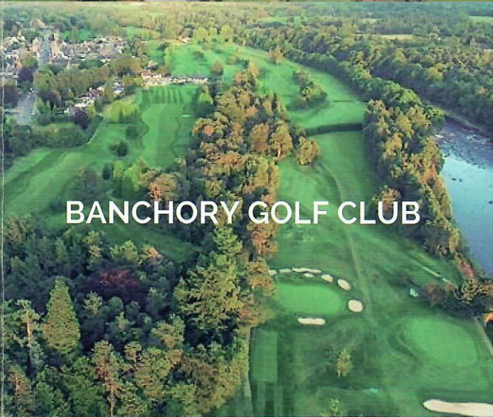
BANCHORY GOLF CLUB